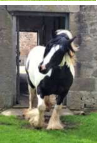
AAPT animals must enjoy the work, not merely tolerate it!